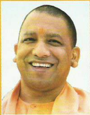
Yogi Aditya Nath Chief Minister U.P.

I Can feel the difference in the quality of education through SKY INTERNATIONAL SCHOOL . Here the management and staff are working together for a common goal, that goal is 'Complete international education to our society'. Most of the educationalists are dreaming about the most modern education for the rural area of our respected country. Now management and staff of SKY INTERNATIONAL SCHOOL made that dream into reality.